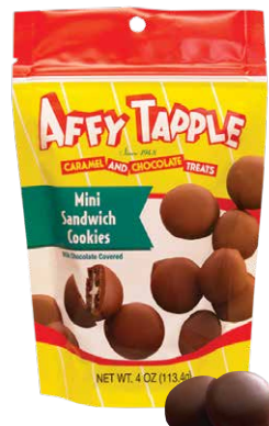
Mini Sandwich Cookies