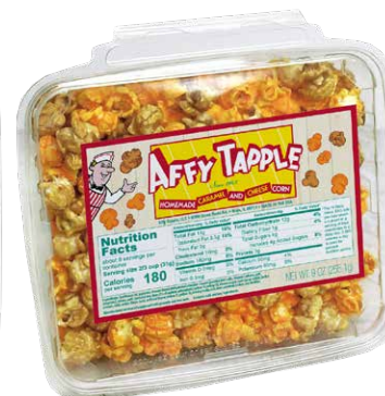
Caramel & Cheese Corn