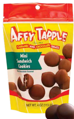
Mini Sandwich Cookies