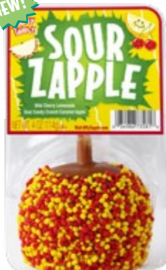
Sour Zapple Wild Cherry Lemonade Candy*