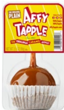
Original Plain Just Caramel