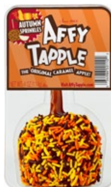
Autumn Sprinkles Orange, Yellow, & Chocolate Sprinkles