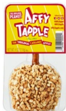
Original Peanut Chopped Peanuts