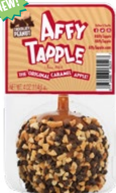
Chocolatey Peanut Chopped Peanuts & Chocolate Chips*